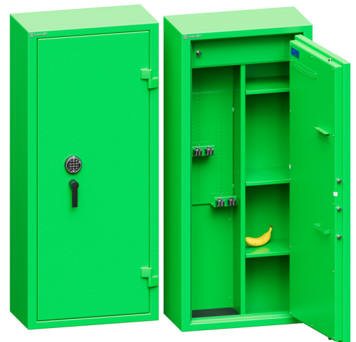
AZS 6 Kombi