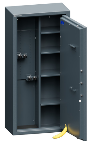
ZS 10/6 Mini