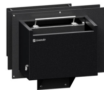
Transfer drawer KFC 49