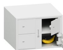
Locker cabinet 4locker