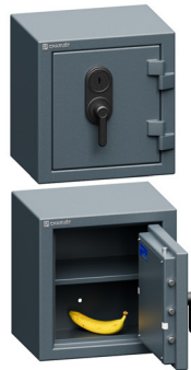
ZS 6 Micro