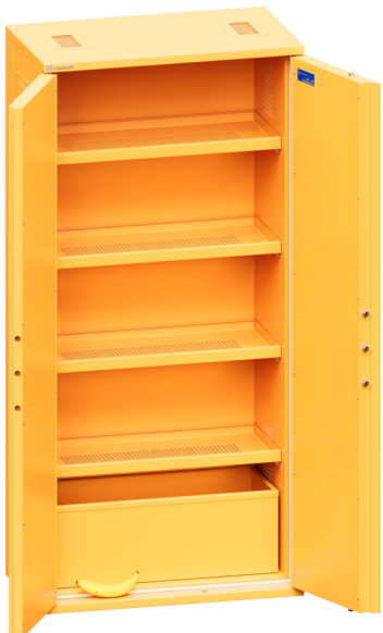
LLOYD 90D CHEM