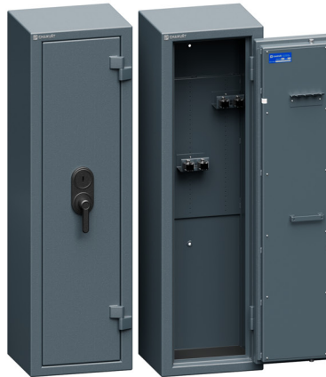
ZS 6 Mini