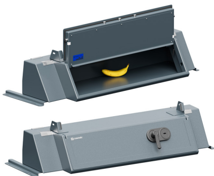
GS for Jeep Wrangler JL 2018+

Other products that cannot be classified into current categories at this time. On demand, we could offer wall, floor safes, car safes or safes designed into furniture.