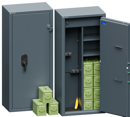
ZS 10/6 - M2A1