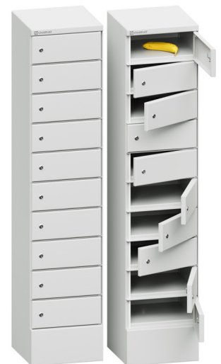
Locker cabinet 10locker