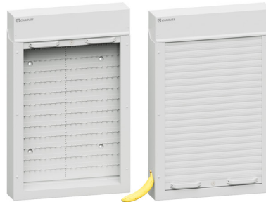
Roller key safe