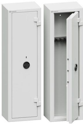
WeSA 6 Mini

Safe storage of weapons and ammunition according to the law. The safe meets the requirements for the storage of up to ten weapons and ammunition according to Government Regulation No. 217 of 10 July 2017 on requirements for the security of weapons, ammunition, black hunting powder, smokeless powder and matches and on ammunition storage.