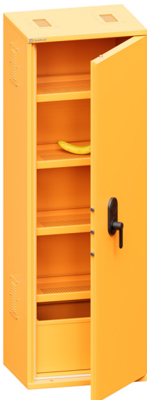
LLOYD 90C CHEM