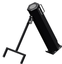
Discharging device ZH 14